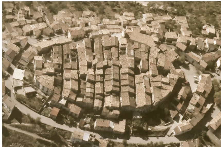
Aerial image of borgo di Castelvecchio Calvisio