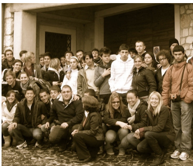
2009 workshop with students from IPSIASAR, l'Aquila