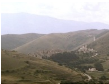
Castelvechio Calvisio landscape

The Borgo Abruzzo Project is committed to helping revitalize the historical town of Castelvechio Calvisio (AQ) and surrounding region, marred by abandonment and further crippled by the 2009 earthquake. It aims to achieve this mission by planning and implementing culturally, economically and environmentally sustainable solutions to the town’s decline and decay, melding local values and traditions with new economic models and cutting-edge strategies for enhancing, promoting and disseminating knowledge of the area.