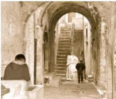
2008 workshop sketching