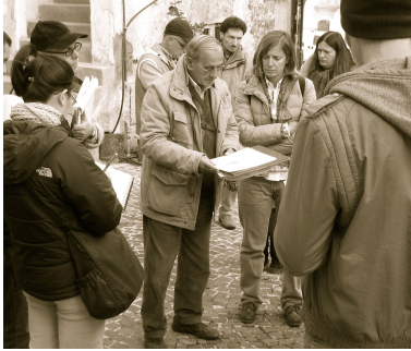
University Workshops, 2009-10

economy, allowing a rich offering of local establishments to thrive. Among these we envision “alberghi diffusi”, restaurants and cafes, food shops for local specialties, artisan shops, workshops for the building trades, but also activities connected to a broader global economy providing services and showcases for temporary and new residents (internet providers, graphic design and production, art galleries, electronics services). Regional transportation services would also be upgraded to serve a growing need for connections both between the region and the capital (improving service on Rome-Pescara lines) and amongst the towns in the region (creating an efficient, ecological local bus service).