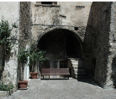
Piazza del Borgo

We envision site-sensitive integration of solar and wind power generation, land and water husbandry, protection and restoration of biodiversity.